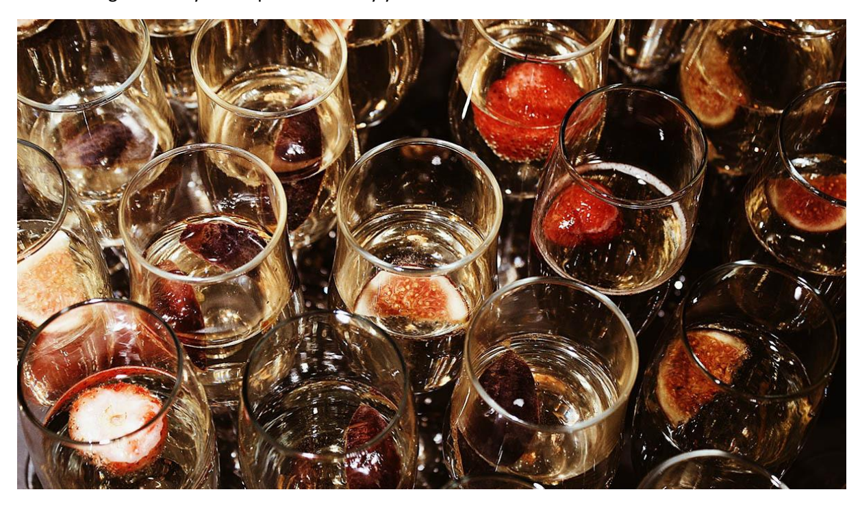
SUNDAY 09 JUNE

A bar will again be at your disposal to satisfy your desires.